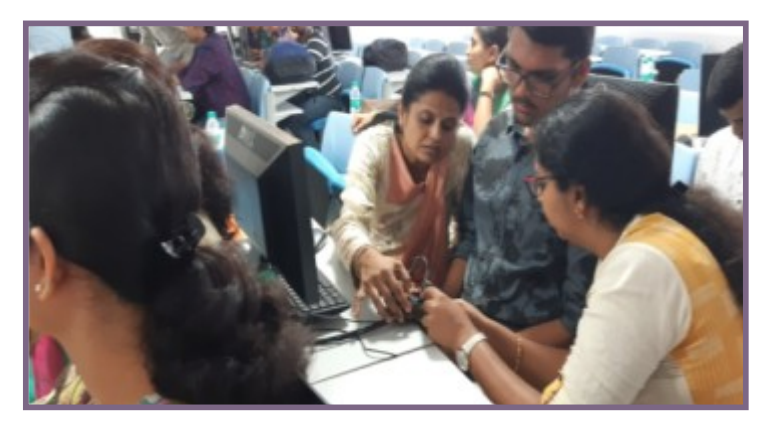
Participants working on Internet of Things