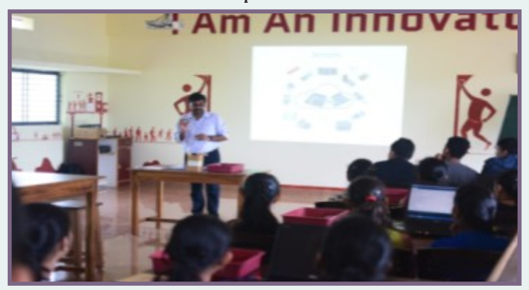
Product development for industrial applications using Arduino