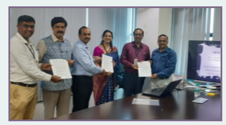
MoU with GSSSIETW, Mysore