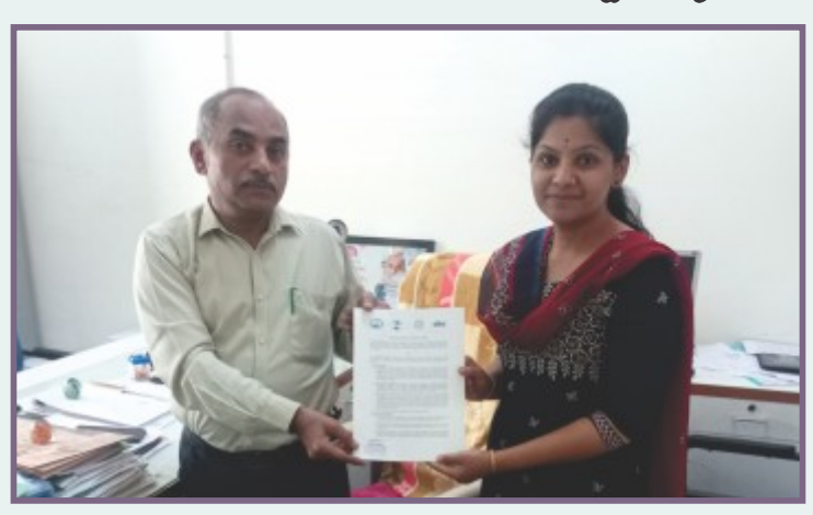
MoU with SSIBM College, Tumkur