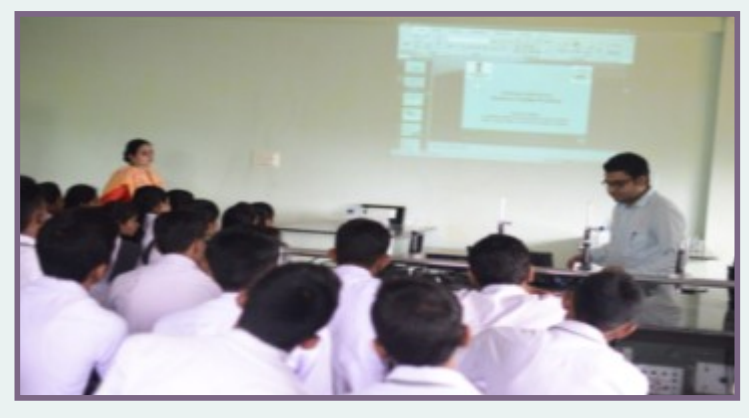
What's new in Nanotechnology and Microscopy