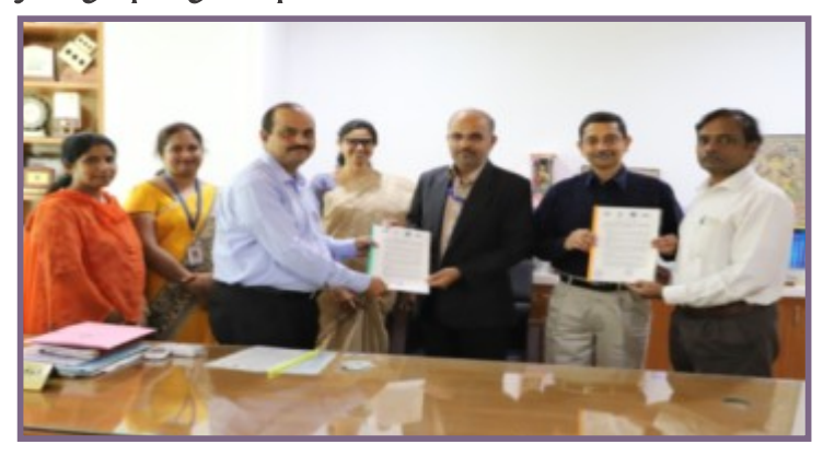
MoU with BMS College of Engineering, Bangalore

We have also collaborated with several Corporates working in the thrust areas with an intention to offer mentorship to the incubatees and aspiring Entrepreneurs. These tie-ups focus on hand holding the incubatees from an industrial perspective. The mentors have been helping the incubatees in fine tuning their concepts with their vast experience and inspiring the young aspiring entrepreneurs.