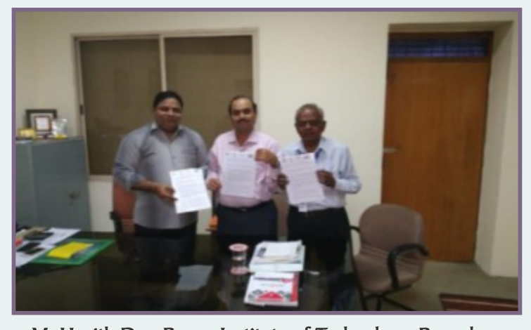
MoU with Don Bosco Institute of Technology, Bangalore