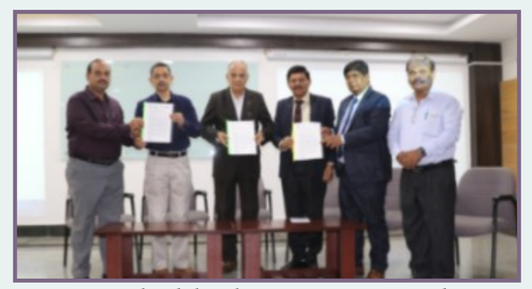
MoU with Adichunchanagiri University, Mandya