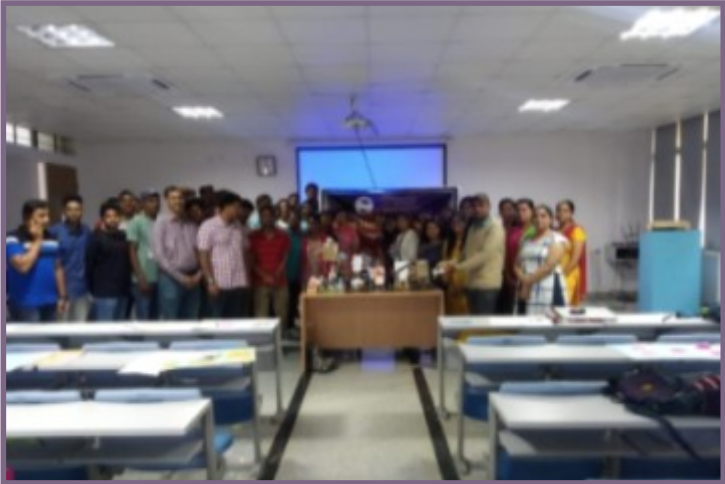
A three-day workshop was organized in association with VP-IT Academy and Bumblee Bee Academy, Bangalore for the partner institutions.

The objective of the workshop was to inculcate in students a sense of empathy towards end customers and ideate multiple possibilities.