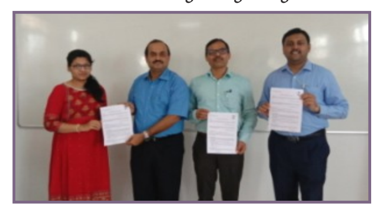
MoU with Greenotronix Pvt. Ltd., Bangalore